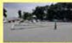
Race Course Road

Race Course Road, Koramangala- Hosur Road, Nrupathunga Road, Nagarabahavi main Road, Palace Road, Jalahalli to Yelahanka road, HAL Airport Road, Thanisandra main road Road to BIAL, Magadi Road, The BJP led BBMP completed 600 mtrs of C.V.Raman Road only. It decided not to widen Roads.