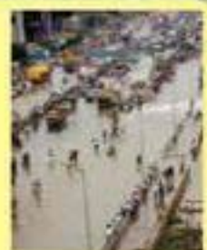
Silk Board Junction Flooding