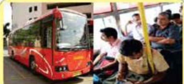
Vajra Buses & Travel Comfort

For the first time BMTC was given State Support to purchase 1000 Volvo buses. This action changed the way BMTC presented itself before the citizens of Bengaluru. These buses provide excellent services especially to Bengaluru International Airport.