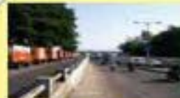
Dairy circle Flyover