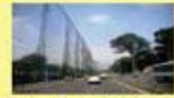
Sankey Road at Golf Course