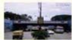
Mekhri Circle Underpass