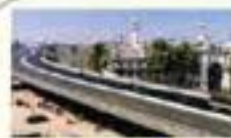
Siri Circle Flyover