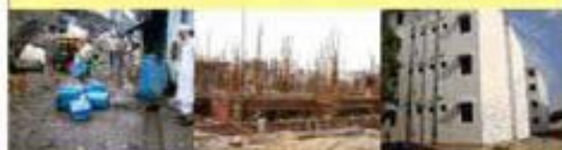
Case of Indira Nagar Slum