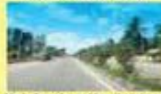
Maj. Sandeep Unnikrishnan Road