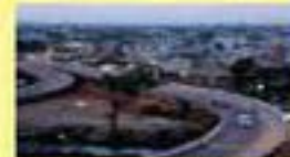
Dommalur Over Bridge