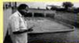
Remodelling of Storm water drain in HSR layout