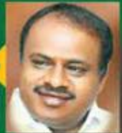
SRI H.D. Kumaraswamy President Janatha Dal (Secular)