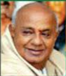
SRI H.D. Devegowda National President Janatha Dal (Secular)

for creating a livable, clean, beautiful & affordable Bengaluru