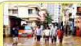
Flooding in JP nagar

Puttenahalli, Central Silk Board, Bhadrappa layout, Agrahara layout, TATA nagar, Nayandahalli and many other areas of Bengaluru were suffering on account of floods. The government led by Sri. HDK acted very quickly and took measures to prevent further flooding of these areas.