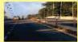
Vijayanagar Grade Separator